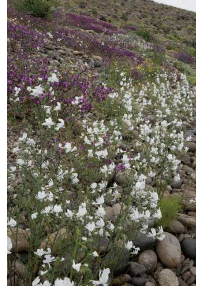
Schizanthus candidus & Mirabilis elegans

Other gullies were choked with flamboyant Alstroemeria philippii and the brimstone cups of Balbisia peduncularis amidst billowing cerise Mirabilis elegans , whilst the impressive multiheaded domes of Copiapoa dealbata grew amidst and exploding sea of intense pink Cistanthe grandiflora just beyond the shore of the Pacific. Blood-red Bomarea ovallei was found, more fine cacti and then over the hills we discovered a lovely trio of tropaeolums, all rushing to bloom in these few benign weeks.