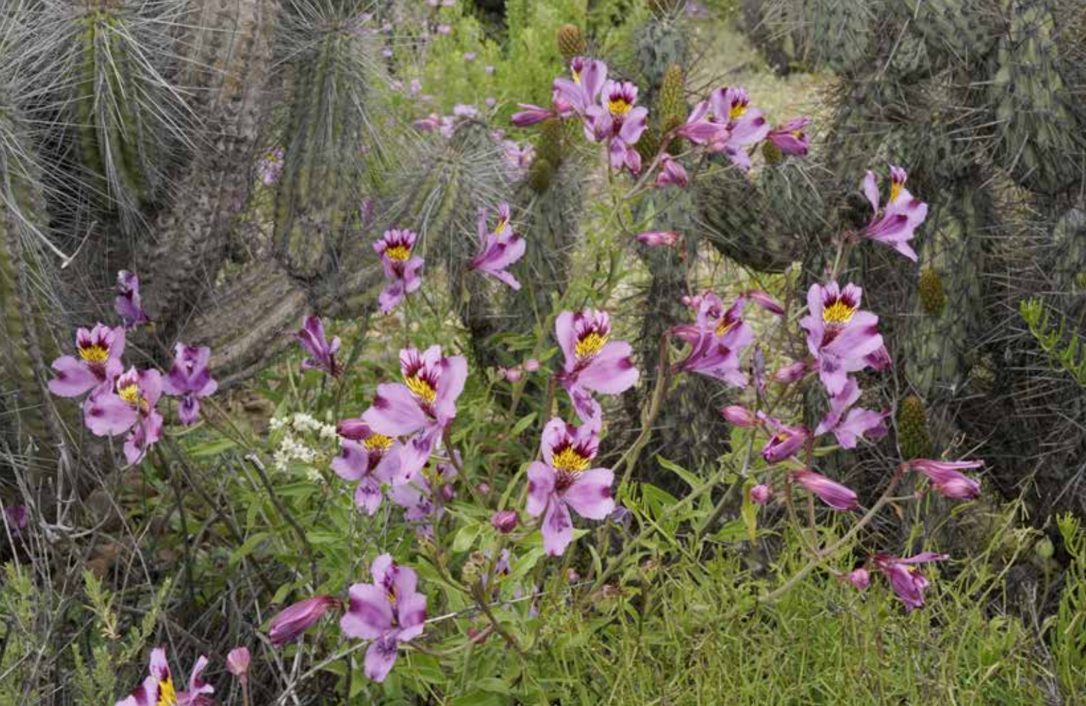
Astroemeria philippii (above)

flowers. The desert 'snow' continued with drifts of Leucocoryne narcissoides and jaw dropping expanses of Nolana baccata that extended to the horizon. Other places were dressed with the varied soft blues of Zephyra elegans , everything laid on in uncountable numbers. It is hard to convey the extent of the flowering, these displays often continued for miles, repeated again and again. One almost became blasé about the whole thing until one recalled the first day in the desert.