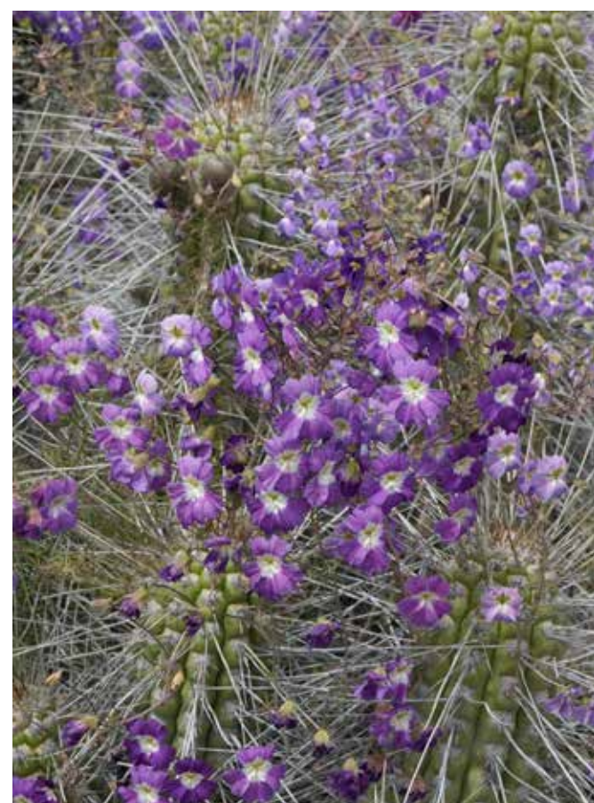
Trolaeoum azureum (above) Zephranthes phycelloides (left)

Scarlet trumpets of Zephranthes (Rhodophiala) phycelloides and tangerine forms of Argylia radiata were sprinkled throughout and every bush of Cordia decandra was encased in white flowers. Draped across the bushes in one canyon was the subtle beige beauty of Tropaeolum kingii , followed by the showier white-centre violet-blue of T. azureum . A final flourish of all the desert flowers saw us leave the Atacama proper and descend into the Mediterranean climate zone, this also disarmingly green. Here every shrub was dripping the lava hues of Tropaeolum tricolor . A few triumphant spikes of Puya bertroniana , the flowers an indescribable blue-green completed that day. If we thought, we had seen bulb displays up to this point we were wrong.