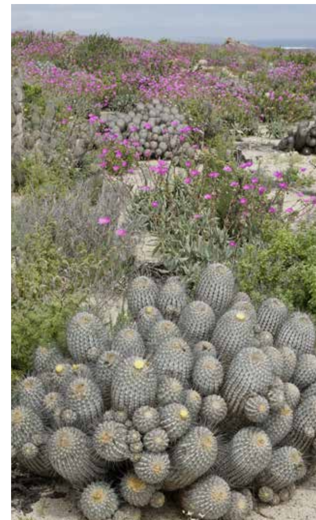
Copiapoa dealbata & Cistanthe grandiflora