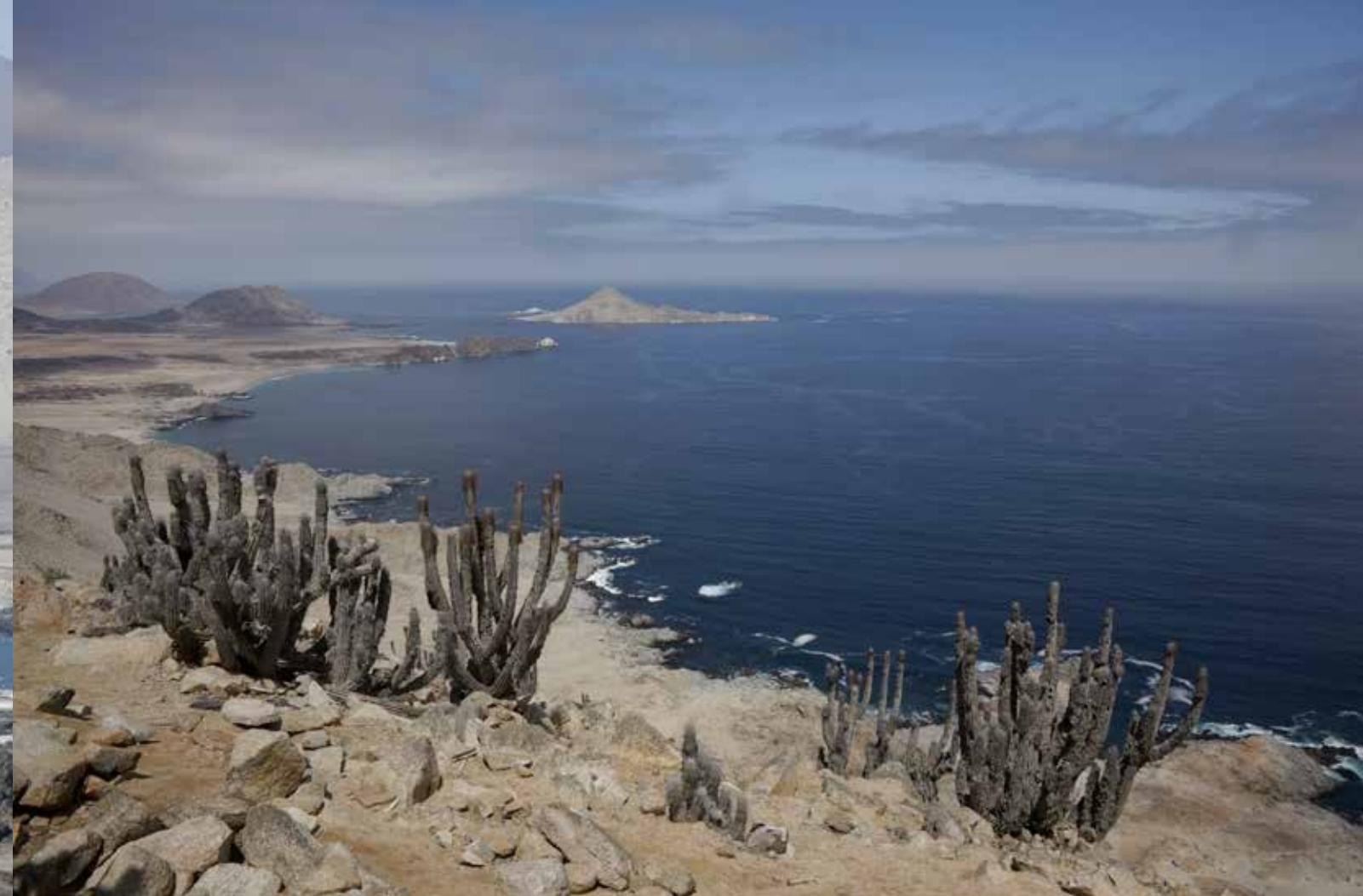
Pan de Azucar

Every so often an event occurs that surpasses expectation. Whispers about this year's rain in the southern Atacama eventually became more definite fact and we took the opportunity/risk to organise a trip to see this rare spectacle. Anyone arriving into Antofagasta last month might have been a touch concerned at the endless dry hills and sandy plains. Indeed, our trip began with a view across the crumpled coastal ranges down to the cloud sea that filled the lower valleys. The coastline of Paposo was impressive and the populations of Copiapoa cinerea subsp. haseltoniana fabulous, but there was not much in flower. This was to prove an interesting contrast between what followed. These very same dry areas can look utterly different following rain. Half way through the next day the flowering desert began to reveal just how different. Heliotropium pycnophyllum bushes were completely smothered in flowers that it was hard to see any leaves and the slopes were generously sprinkled with dainty white Leucocoryne appendiculata . The viewpoint along the coast was magnificent. A hundred miles further down the road and every bush