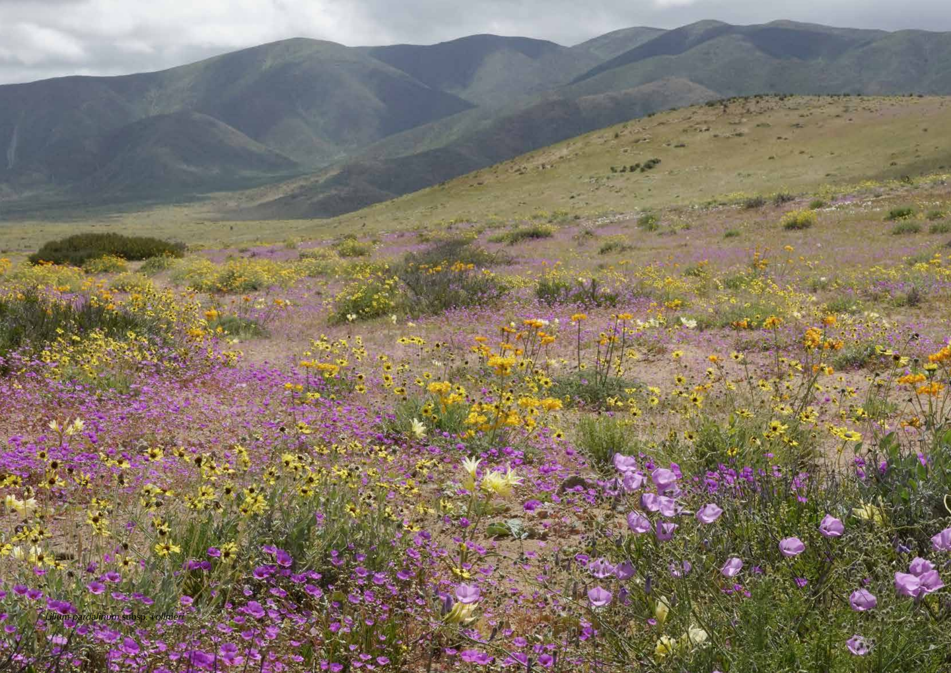
Lilium pardalinum subsp. vollmeri