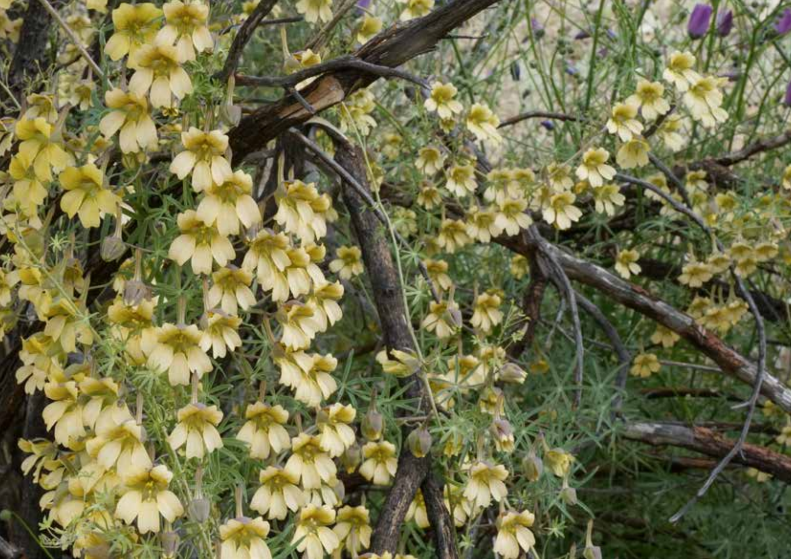
Trolaeoum kingii (above)