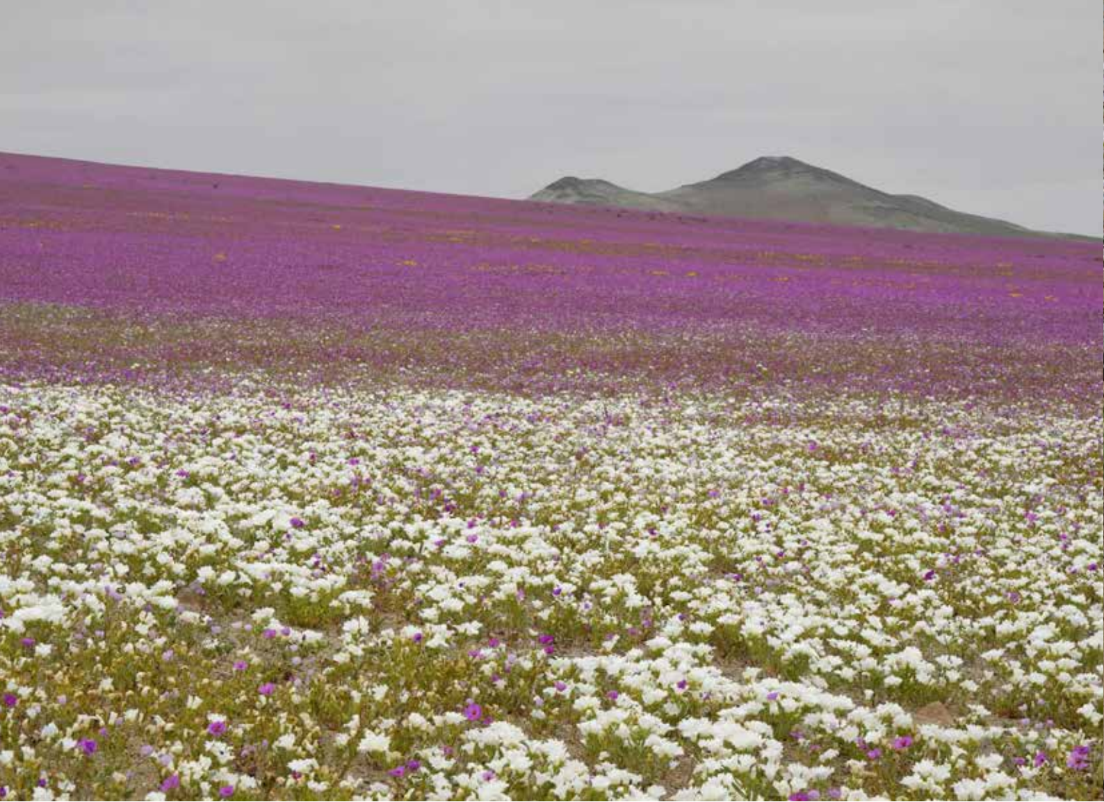
Cistanthe longiscapa (pink) & Nolana baccata (white)