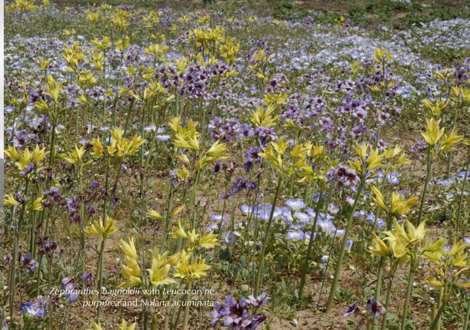
Zephranthes bagnoldii with Leucocoryne purpurea and Nolana acuminata