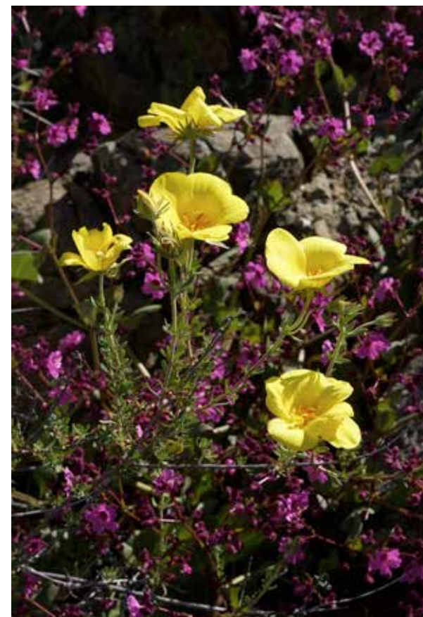
Balbisia peduncularis (above)