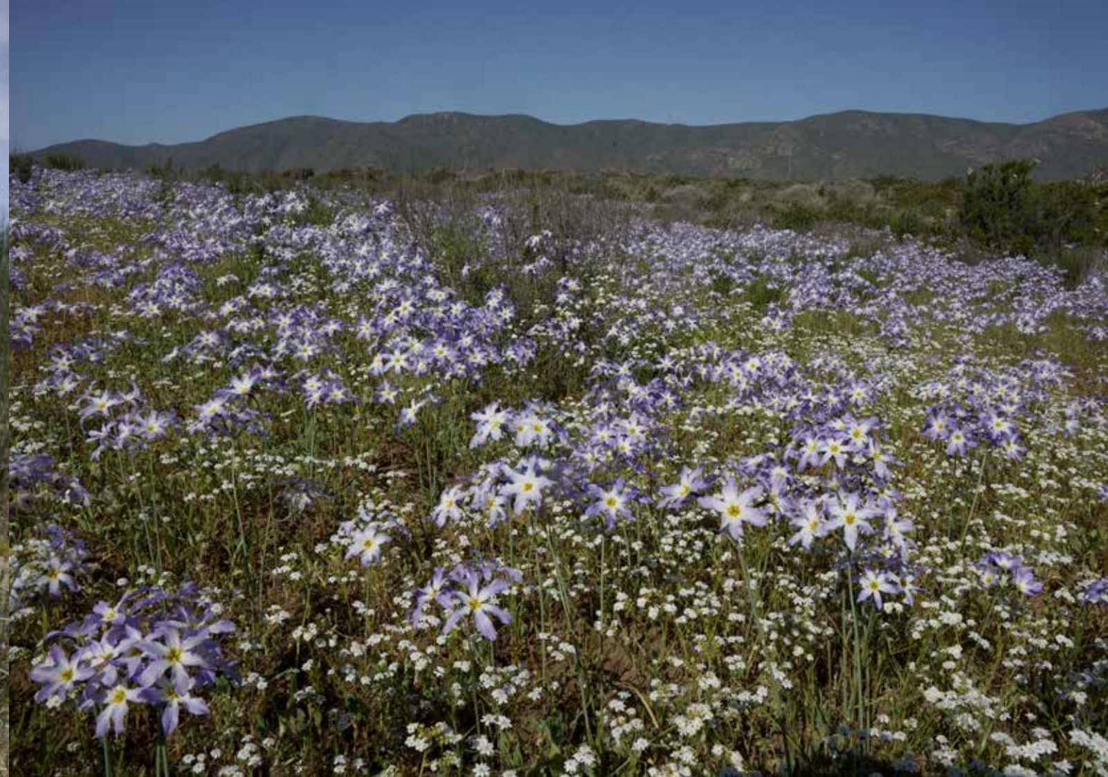
Leucocoryne coquimbensis & Cryptogramma sp.

travelled along the main road, the side frequently covered in thick drifts of Leucocoryne . Sandy flats had countless L. purpurea , a particularly attractive species and these (and other species) filled very back yard, open space and roadside verge in a mind-blowing display. I do not exaggerate; they were truly uncountable. One area had hundreds of sulphurous Zephyranthes ( Rhodophiala ) bagnoldii bursting from a dense carpet of Nolana acuminata . Moving away from this might have brought some respite, but the hills nearby were bursting with the most sensational displays of Alstroemeria magnifica I have ever seen, mainly white but with deeper pink forms, there was scarcely a spent flower it was so perfect. To finish a day of visual overload, where deciding where to point the camera becomes mute and one needs to simply sit and take it all in we sat on rocks amidst endless drifts of thousands of a handsome blue form of Leucocoryne coquimbensis , trying to assimilate that this abundance was being repeated hundreds of times over for miles along the coast.