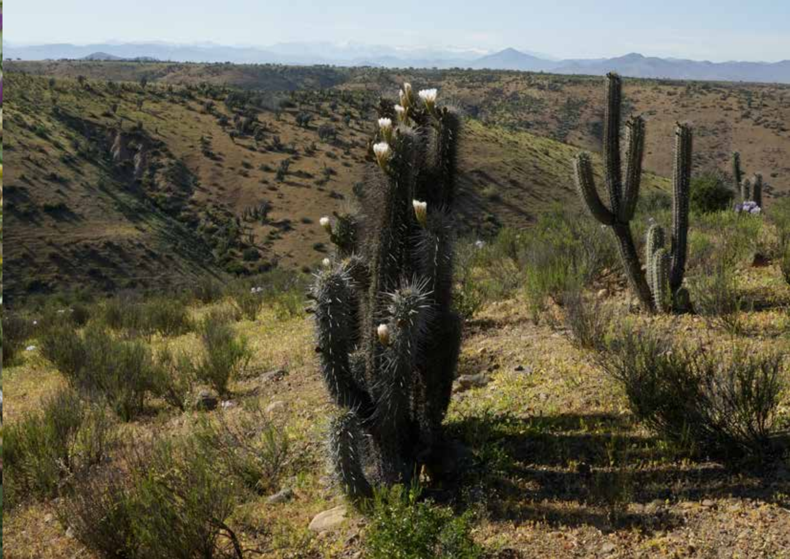
Leucostele (Echinopsis) skottsbergii