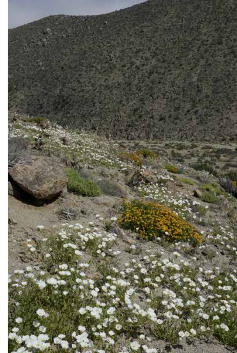
Nolana acuminata & Heliotropium linariifolium