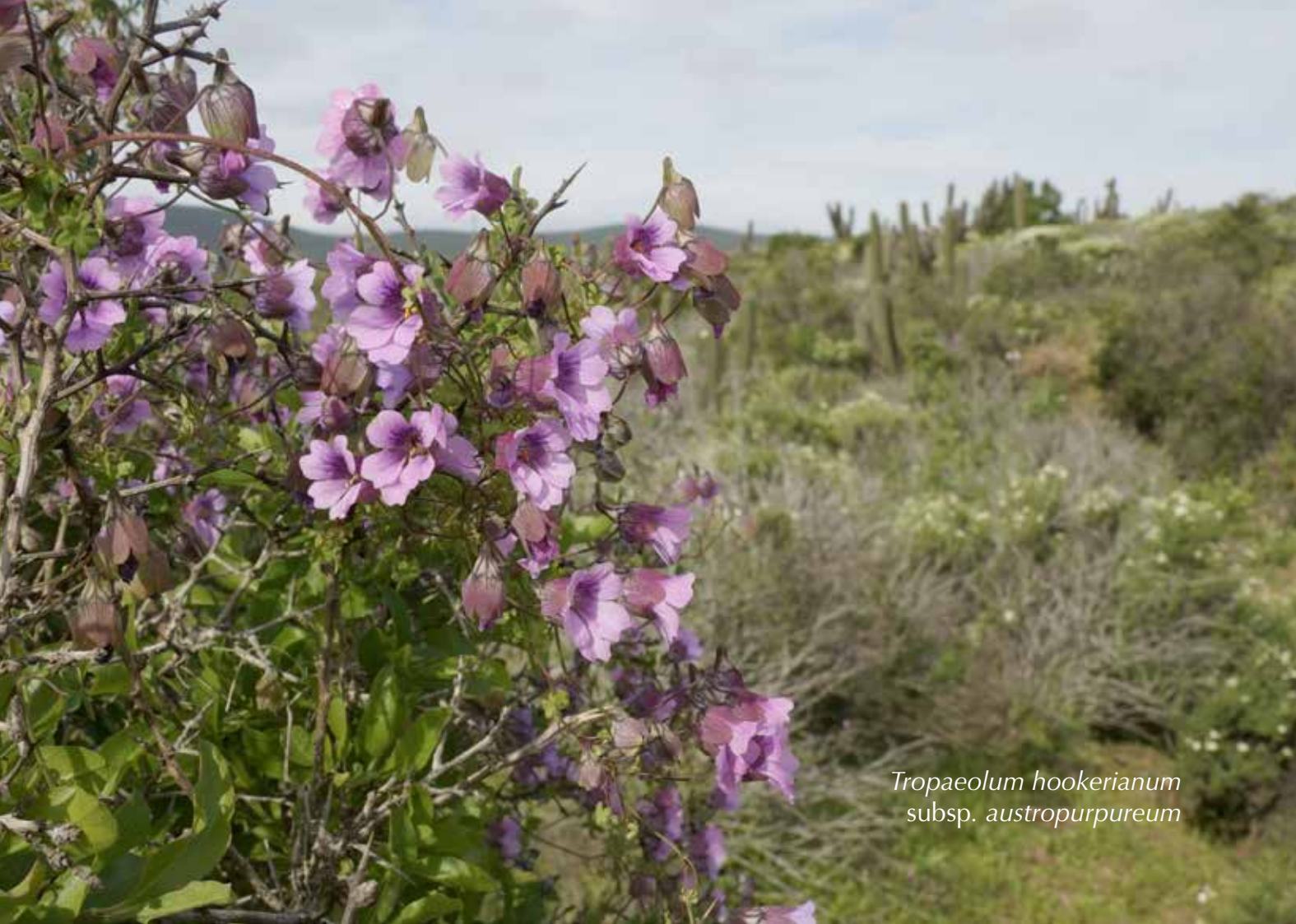
Tropaeolum hookerianum subsp. austropurpureum